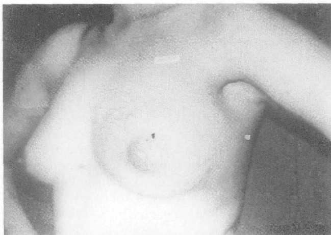
Fig 4 . Breast Cancer

fails to complete radiotherapy because of socio-economic reasons, the choice of treatment was wrong for her. She would have been better off with a MRM.