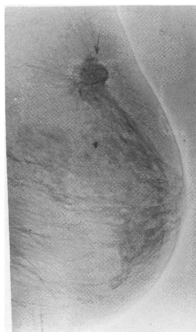
Fig 2 . Breast Cancer

Mammograms are very useful in detecting small lumps in large breasts, where clinical palpation is likely to miss small lumps. It is very useful as a screening procedure in menopausal women. It is of limited value in younger