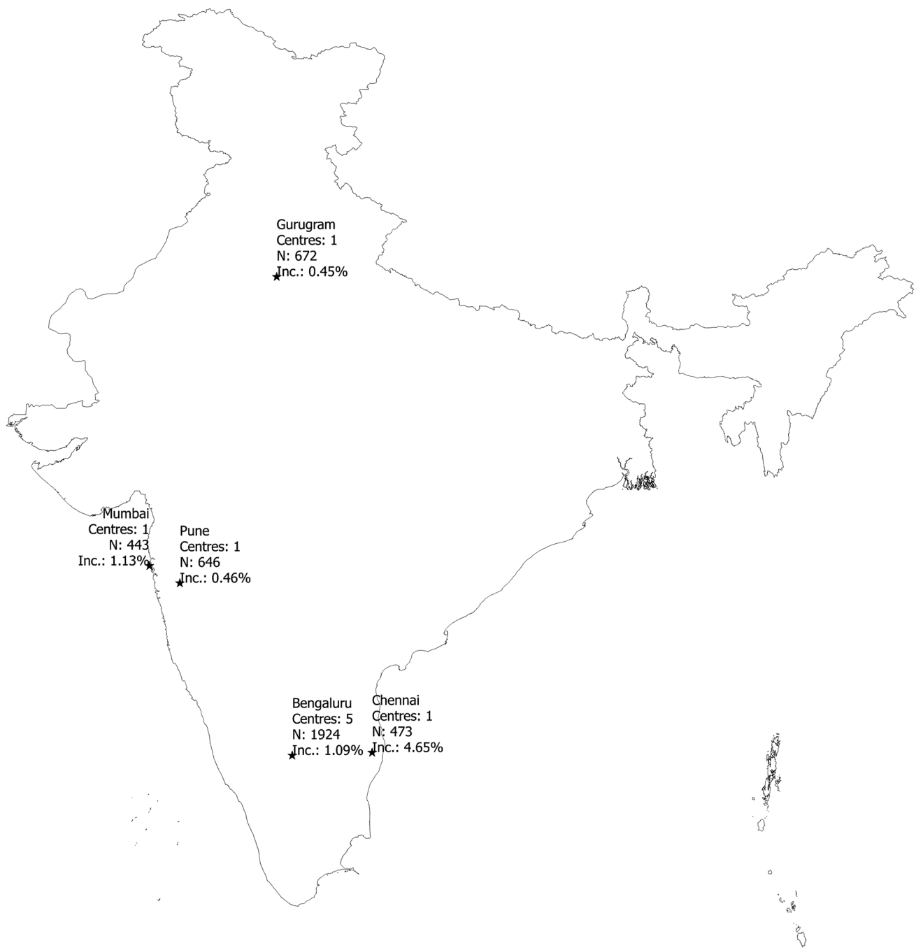
Fig. 2 Geography-wise incidence of SARS-CoV-2 in asymptomatic pregnant women

Although this is first such study in India and an attempt was made to capture data from diverse geographical