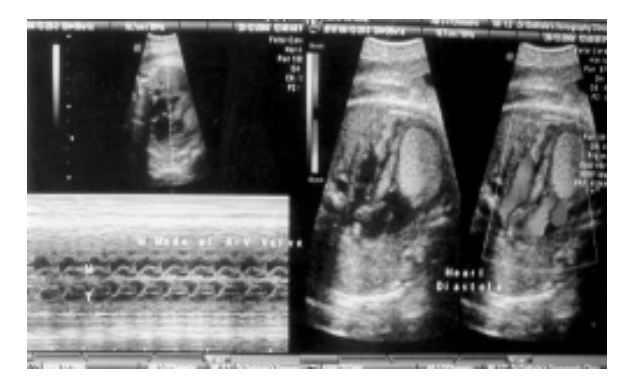
Figure 2. Echocardiography showing normal function.

neonatologist. The postnatal course of the neonate and the mother was uneventful. Both the baby and the mother were discharged on the 9<sup>th</sup> postoperative day. At the follow up after 1 month the baby had no skin lesions and the neonatal echocardiography was consistent with the previous findings.