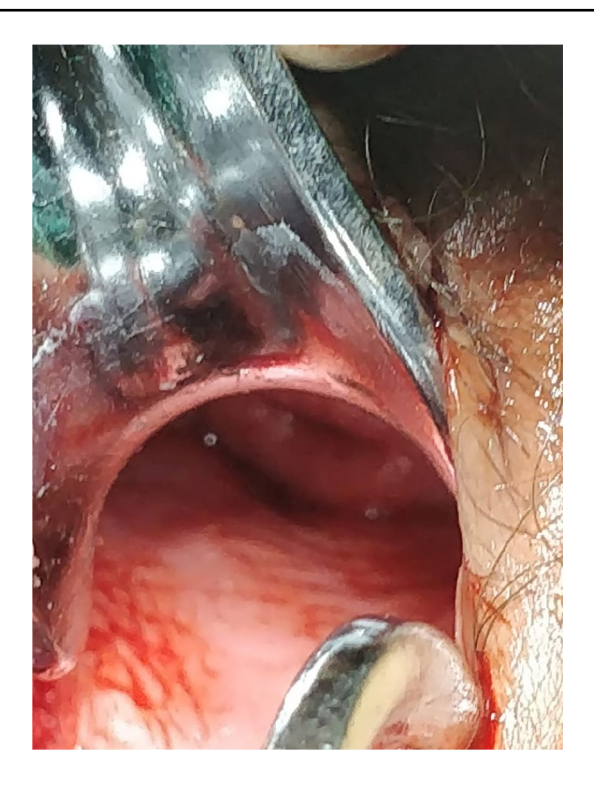
Fig. 3 Per-operative after surgical dissection, normal vagina was seen with rugosities. Normal urethral opening was seen 1 cm below clitoris. Cervix was also normally visualized