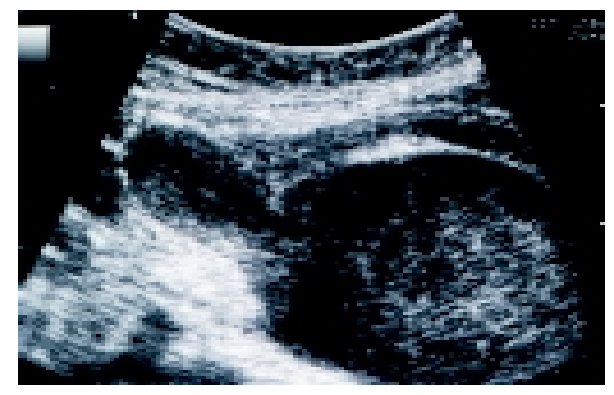
Figure 3. Ultrasonography showing hematometrocolpos