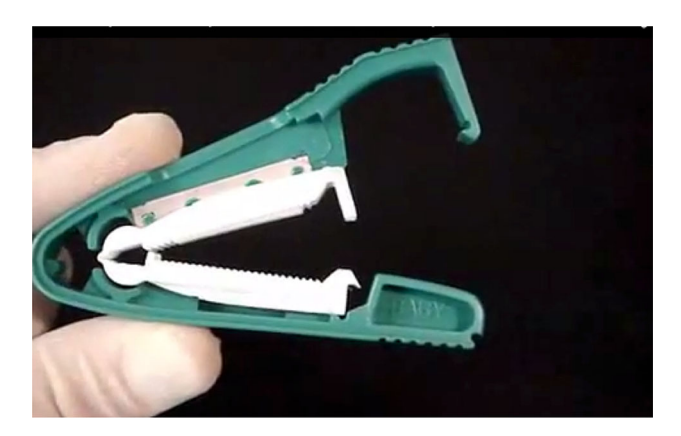
Fig. 1 EZ Clamp<sup>®</sup>—umbilical cord clamp