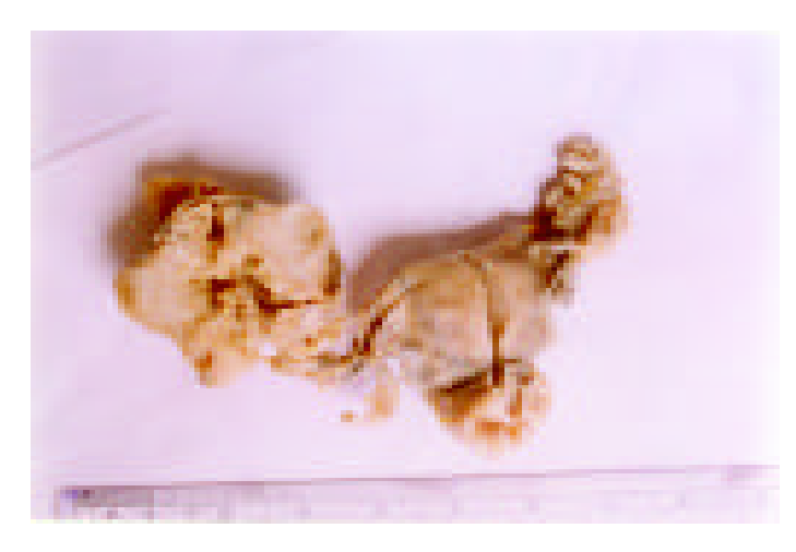
Figure 1. Total abdominal hysrerectomy specimen with right sided tumor of fallopian tube distending tubal lumen with soft gray tissue.