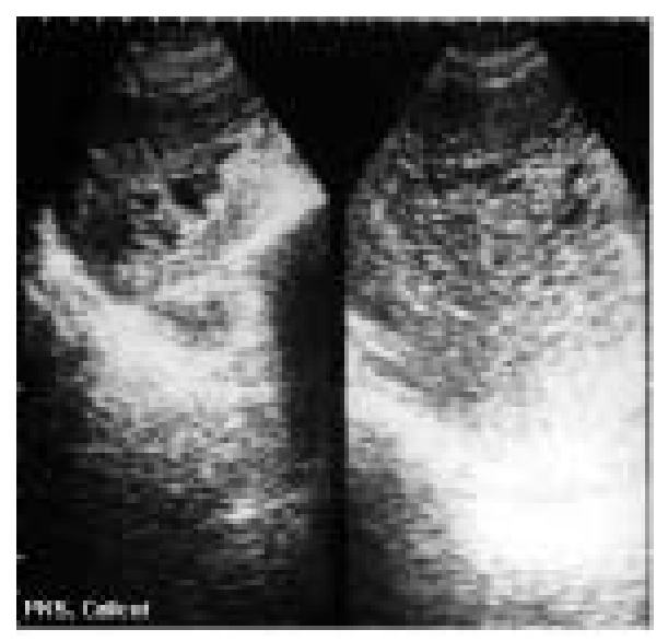
Figure 1. Snowstorm appearance on USG in complete hydatidiform mole

Patients usually present with vaginal bleeding; hyperemesis is a common complaint. The classical findings of a large uterus with early onset preeclampsia and the presence of big lutein cysts are rare to see now thanks to the routine use of ultrasonography for the evaluation of early pregnancy. The classical snow-storm appearance is evident if the ultrasound study is done in late first trimester. Partial moles may be misdiagnosed as missed abortion. Hence it is mandatory to perform histopathological analysis of products of conception after evacuation. Histopathological differentiation of molar pregnancy maybe challenging. Differentiation of complete and partial mole may require DNA polymorphic markers and study of imprinted genes; complete mole will not have maternally expressed imprinted gene TSSC3<sup>10</sup>. It is important to check