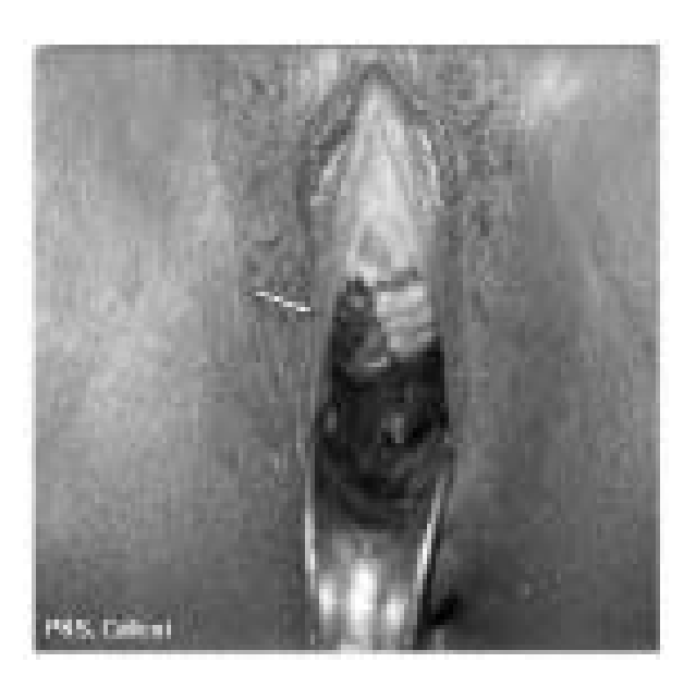
Figure6. Typical appearance of sub-urethral nodule (arrow)