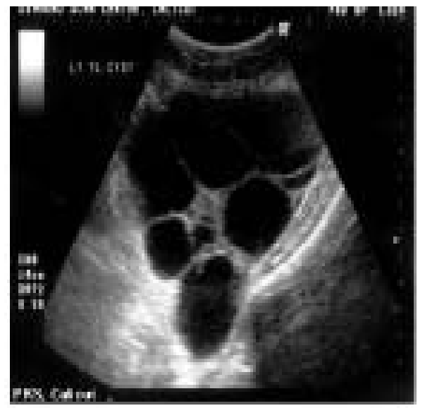
Figure 2.USG theca lutein cysts in hydatidiform mole