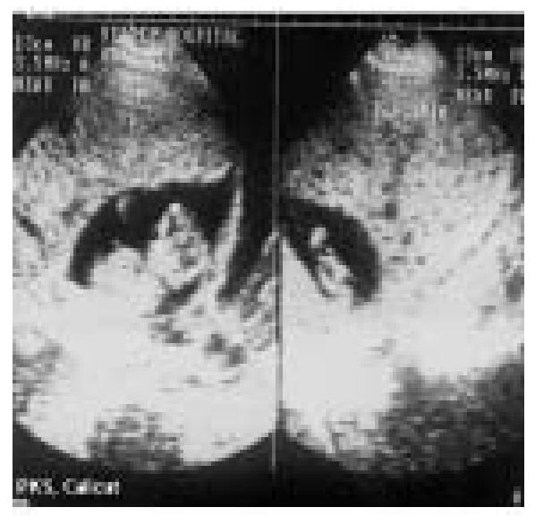
Figure 3. USG of partial mole with focal molar changes and fetus

urinary hCG 10 weeks after evacuation of all miscarriages including medical terminations of pregnancy, as GTN has been reported after such events <sup>11</sup>.