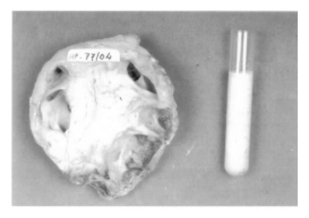
Figure 1. Cut surface of a mass showing multiple cystic cavities of varying sizes totally replacing normal breast parenchyma. The milklike contents are seen in test tube.

Gross examination showed single grayish white, cystic mass measuring 8x6x5cm. External surface was bosselated. Cut surface revealed multiple cystic cavities of varying size totally replacing the normal breast parenchyma. The largest cavity measured 5x5.7x2cm. The walls of the larger cavity were thickened. On bisecting, approximately 500 ml of milk like fluid came out (Figure 1).