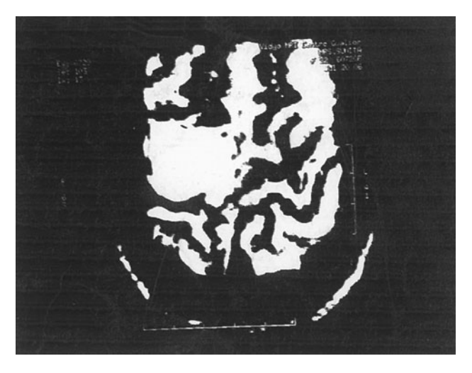
Fig. 3 MRI

intracranial pressure like papilledema, as in the first case and/or focal seizures as in the second case. Hypertension may be secondary to convulsions, due to neurocysticercosis MRI scanning should be carried out in suspected cases as it is a safe procedure during pregnancy.