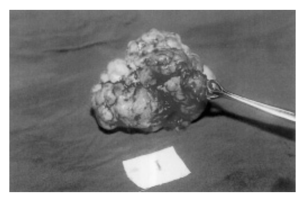
Figure 2. Irregular mass arising from the left fallopian tube and babcock clamp showing he fimbrial end.

The histopathology report of the mass arising from the left tube showed spindle cells having hyperchromatic nucleus and mitosis more than 10 per 10 high power fields suggestive of leiomyosarcoma of the fallopian tube (Figure 3).