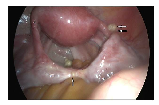
Fig. 2 Laparoscopy showing Kissing fallopian tube sign in a proven case of female genital tuberculosis ( arrow ). Caseous nodules are also shown ( double arrow )

nodules/tubercles) or positive findings of FGTB (shaggy areas, pelvic adhesions, straw-colored fluid) [2, 3]. In the present case, there were definitive findings of FGTB with caseous nodules with confirmation of diagnosis on histopathology of biopsy from the nodule. The new sign (Sharma's Kissing fallopian tubes sign) probably occurred due to secretion of caseous material from the tubes leading to their fusion and distension and blockage and adhesions to each other and to posterior surface of uterus due to sticking caseous fluid. It is felt that new sign observed during laparoscopy can be used as a diagnostic test of FGTB. However, more studies are needed before it is routinely recommended in clinical practice.