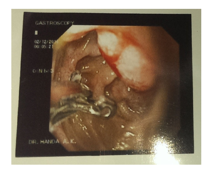
Fig. 2 Upper gastroendoscopy showing an ulcer in the D2 region of the duodenum

(Figs. 3, 4). FIGO stage at diagnosis for paraspinal muscle metastasis and breast metastasis was stage IIIB, and for duodenal metastasis it was IIA, i.e., had locally advanced disease, and all the patients had developed complete local control after concurrent chemotherapy and radiotherapy. The duration of development of metastasis was 12 months after treatment for paraspinal muscle metastasis, 15 months for breast metastasis, and 17 months for duodenal metastasis (Table 1).